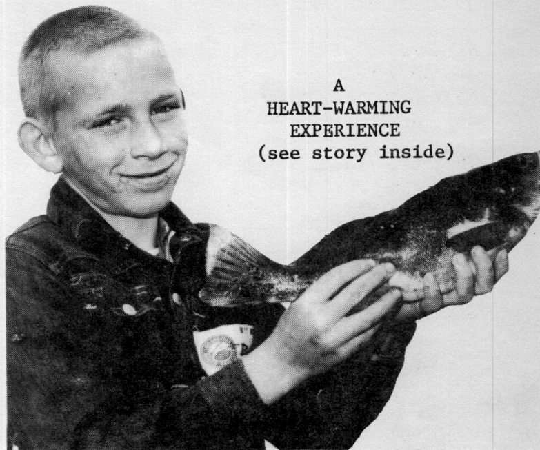
A HEART-WARMING EXPERIENCE (see story inside)

We made a Foundation grant of $3,000 to Caltech in 1971 for this project. Further grants for a total of $7,000, made in 1972-73, were matched 2 for 1 by NOAA Sea Grant funds. A letter from Caltech, reproduced herein, expresses appreciation for our support.