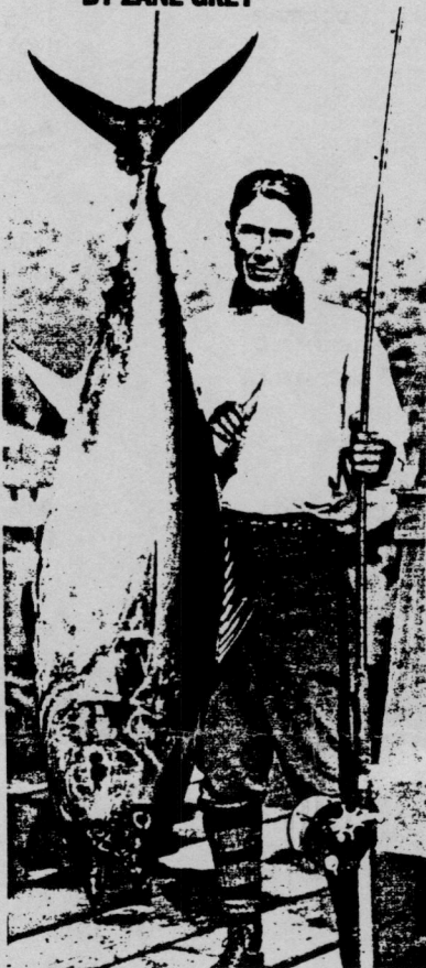
Grey, famous for his novels of the Old West, loved deep-sea fishing and wrote about it often. Here he shows off a 115-pound tuna he caught near Avalon in 1917.