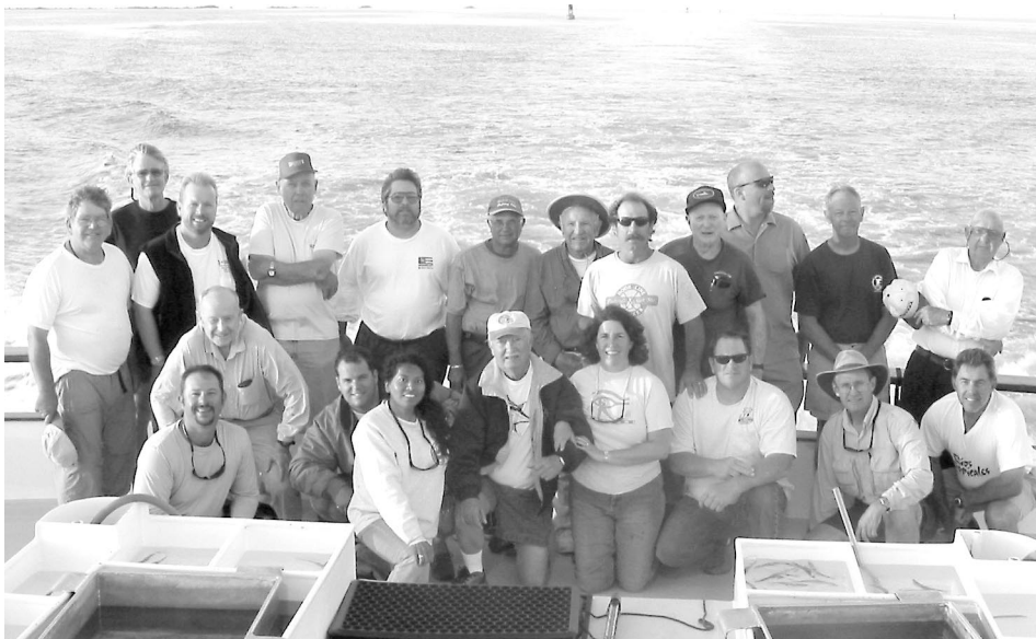
The happy group