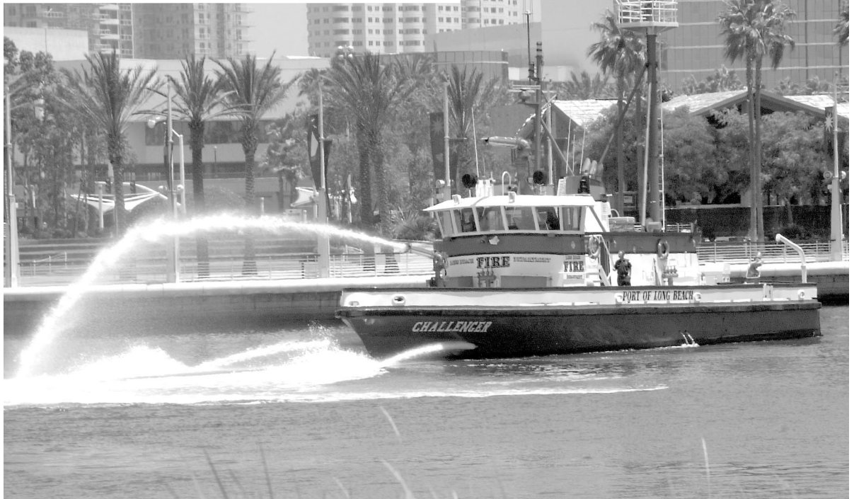
Fireboat entertaining the kids.

Plan on being part of the 56th Annual Kids' Trip next year!!