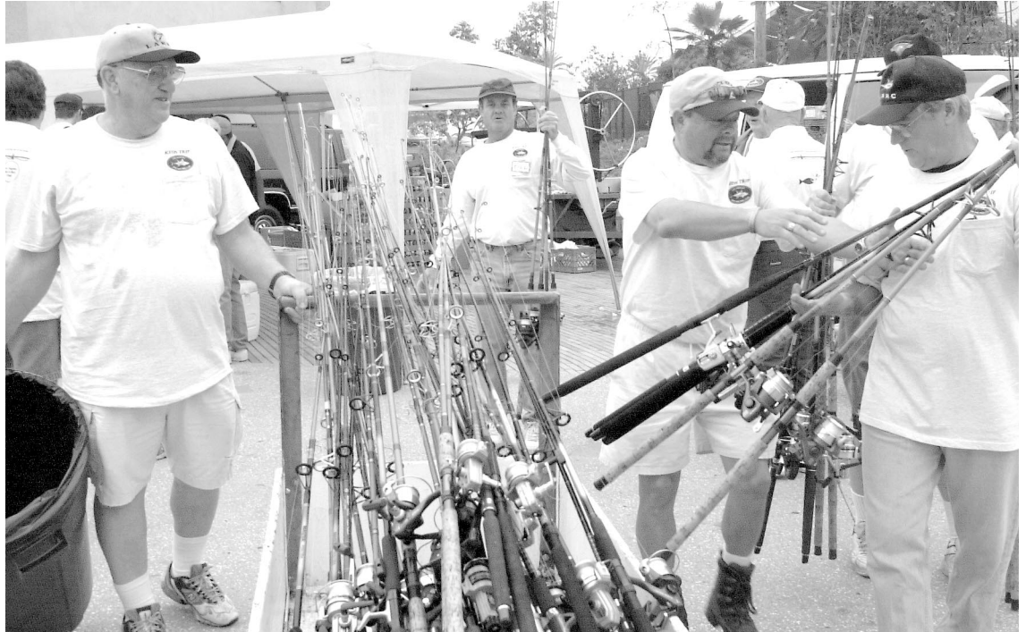
Volunteers readying tackle.

I went back over some 2003 Chum Lines and noted that we were then talking up the 54th Annual Kids' Trip. So the July 12th trip, recently concluded, must be number 55. That's a lot of history behind another huge success. Over 400 kids were treated to excellent fishing—including a great barracuda bite.