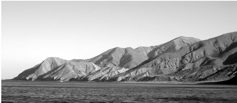
Cedros Island. Note skiff at bottom of pix.