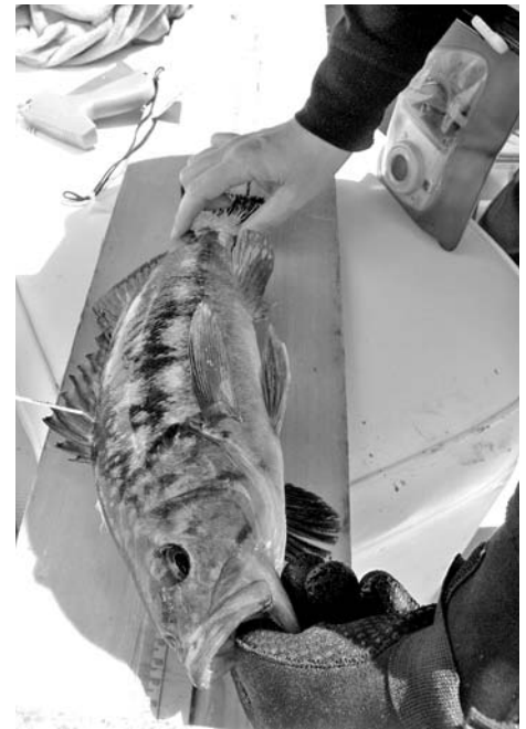
Measuring/tagging a calico.

Our first day's efforts were to take place at Scorpion's a region I fished extensively before the restrictions were put into place. The first myth to be debunked, an area left unfished for multiple years would be teeming with big hungry fish. Not so. Conditions were tough, cool 57 degree water, crystal clear, no wind and most challenging, no current and a slack tide. Obvious solution, search out another area with better conditions. That would be fine if we were there to fish, but we're not, we're there to collect. Damn, I hate fine lines. We must procure our specimens from the designated zone. I collected the first sample and am proud for #1