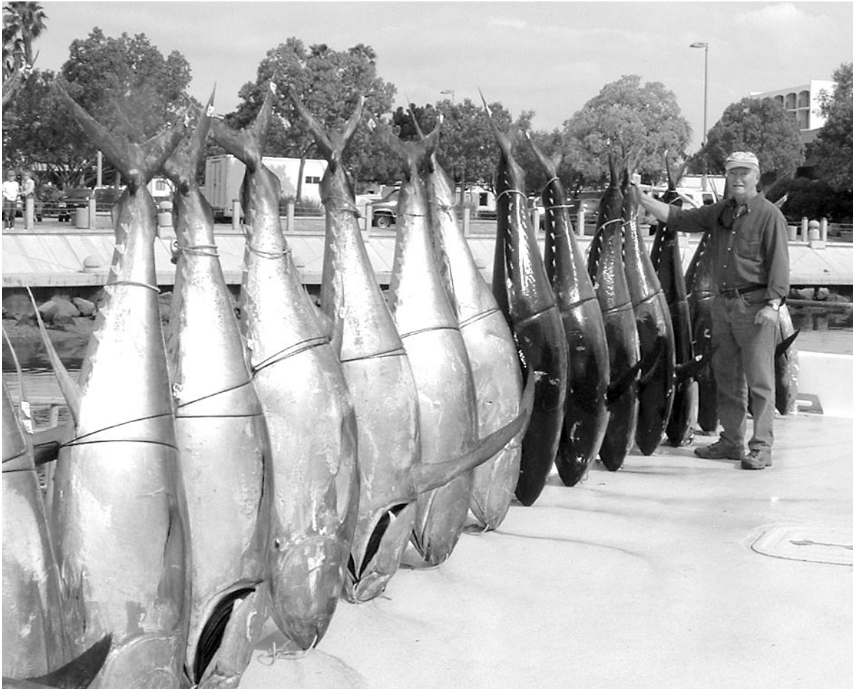
Cows line up at the stern of M/V Excel .

a hill from the depth of the Pacific. It attracts a lot of sea life but of course you never see land. It can blow like crazy at Hurricane but we did enjoy calm weather for the most part. So calm, in fact, that several days out of our seven-day stay there was virtually nothing was caught. I forgot to mention the need for ear plugs above so, add this to your inventory. During the trip down—four days, slow days, and trip back, 550 miles from Hurricane to Cabo to those who fly back, three more days from Cabo to San Diego—there is always at least one person who wants to watch movies in the gallery. The excellent Bose sound system will definitely drive you away. “Kill Bill” was a favorite!