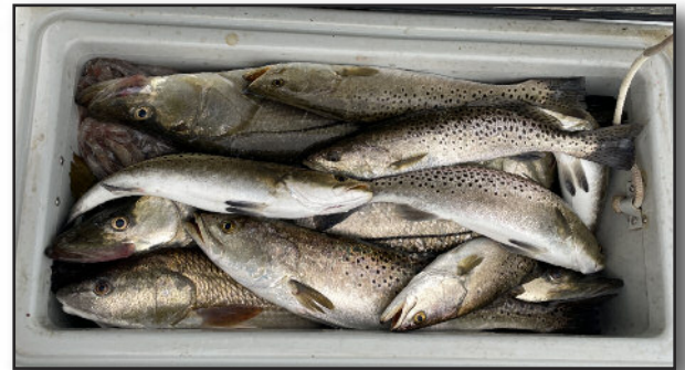
Their cooler full of fun!