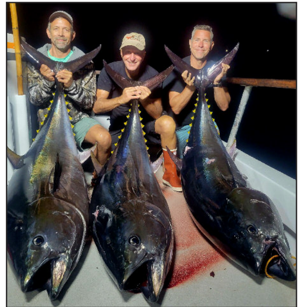
Debello, Brown and White with 3 cow bft.