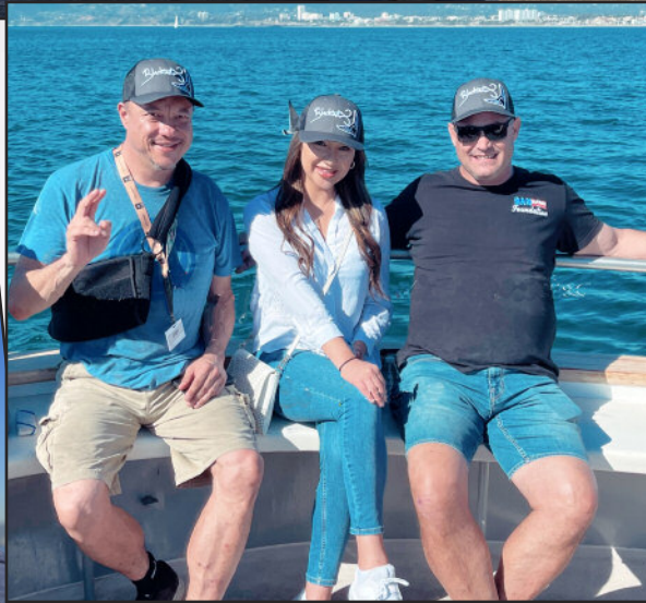
2nd Place, 1st Place, Most fish caught