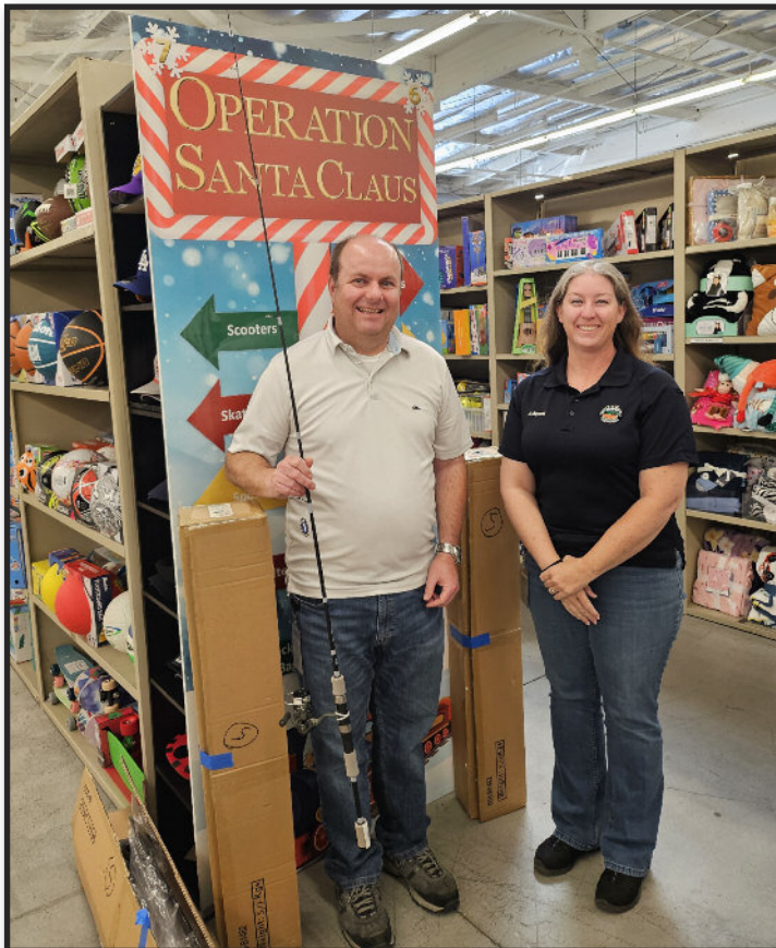
LARRC Foundation donated 15 fresh water rod/reel combos to the Orange County Social Services Summer Santa Program.