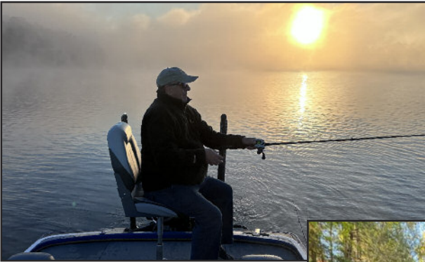
Lake Hartwell, South Carolina