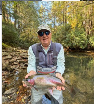
Soque River Clarksville, GA