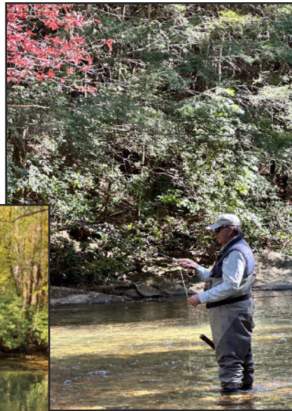
South Carolina Soque River, Georgia