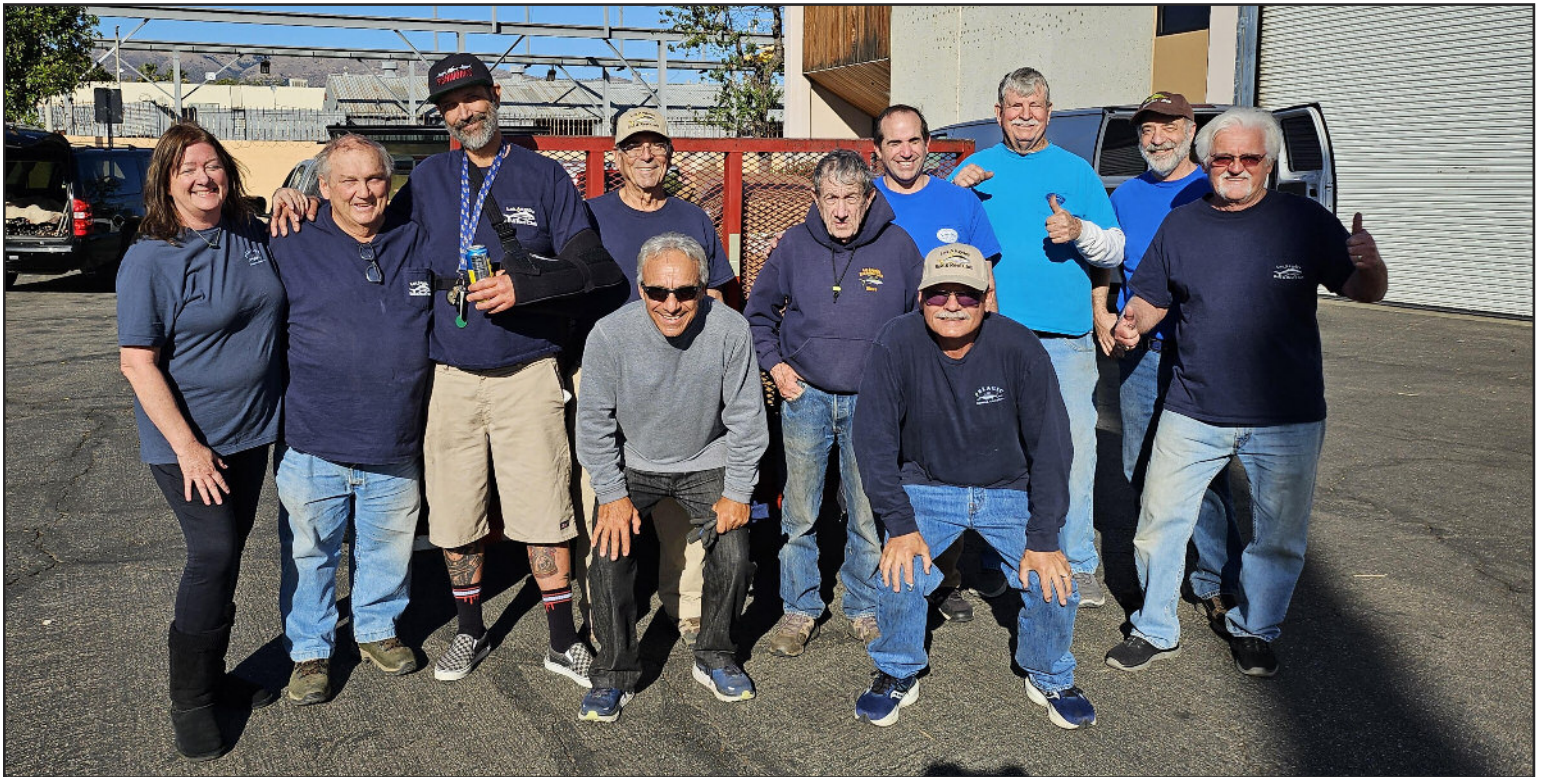
Foundation Tackle Sales Crew

Finally, you should have received your invitation to the 75th Annual Awards Banquet and Fundraiser, which will be held on February 23rd at the Porter Valley Country Club. This will be a special event that you do not want to miss. Please RSVP as soon as possible to make it the best it can be.